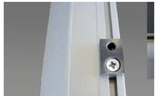
Mounting point with MB threaded inserts.