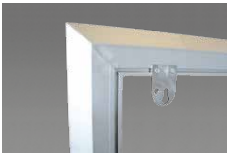
Keyhole plate for wall mounting – horizontal position.