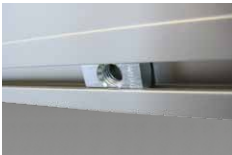
Individually slideable pivot nut MB on frame backside.