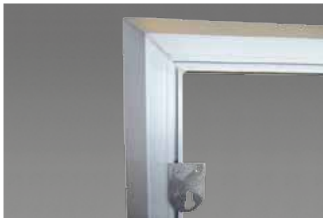
Keyhole plate for wall mounting – vertical position.