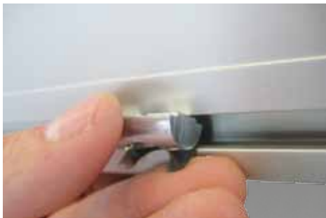
The pivot nut serves as base mounting for the different fittings.

The universal fittings can be positioned individually and allow various mounting options. For a perfect projection result the projection surface is delivered as roll. Please contact us for a quote for your special requirements.