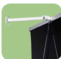
Standard with extension bracket