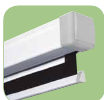
Professional quality manual projection screen