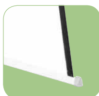
Triangular slat bar