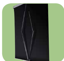
Tensioning arm at the back