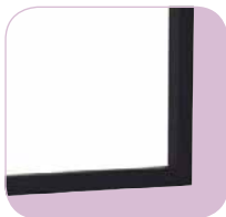
Black matte aluminium frame