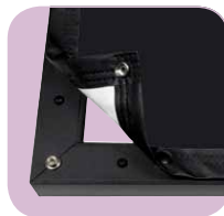
Projection surface attaches with snaps