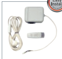
Easy Install Plug and Play RF Remote Control