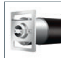
Screen surface assembly