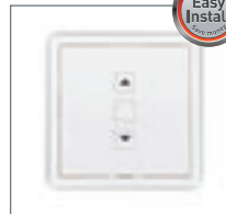
Easy Install RF Wall-Mounted Transmitter