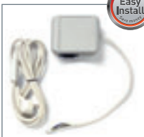
Easy Install Plug and Play Relay Box with Potential-Free Contacts