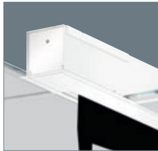
Perfect integration into the ceiling