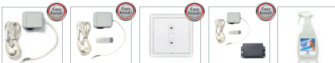
Easy Install Plug and Play Relay Box with Potential-Free Contacts