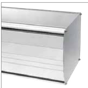
Robust case with a powerful motor.