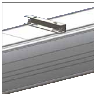
Adjustable mounting brackets