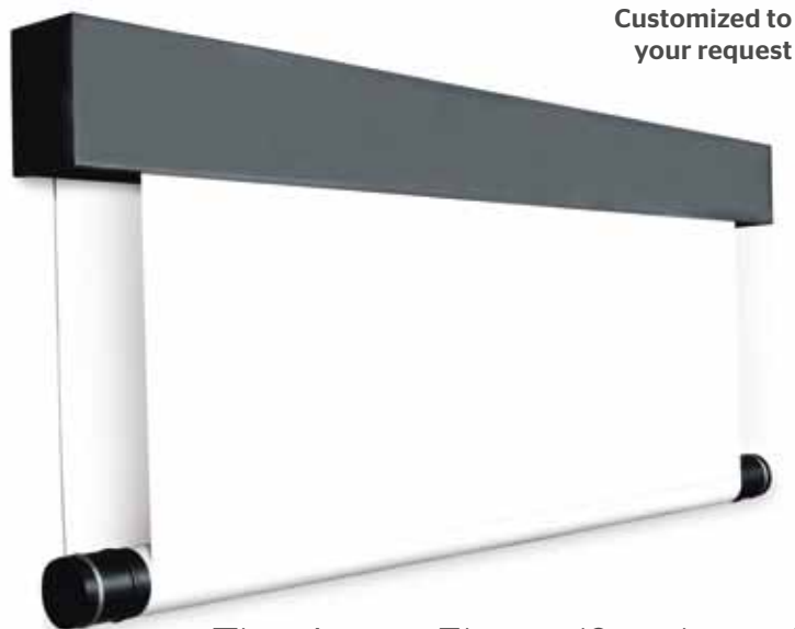
Customized to your request

Motorized projection screen - 12 meters wide by 6 meters height maximum