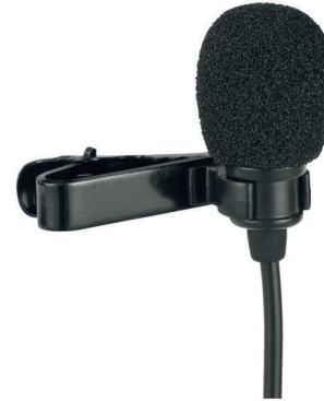
Lavalier microphone with clip