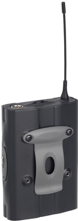
Belt-pack rear view