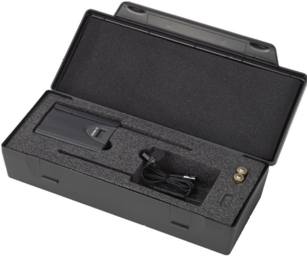
Protective case with wireless, belt-pack and accessories