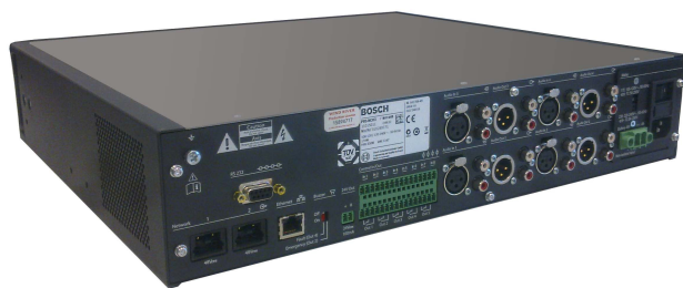
PRS-NCO3 rear view