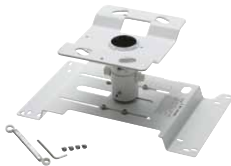
Tailor-made ceiling mount for easy installation and security