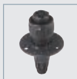
PS 3 F-Lock included