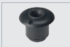
H 500: Optional shock mount