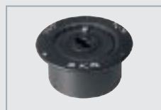
H 600: Optional theft-proof shock mount